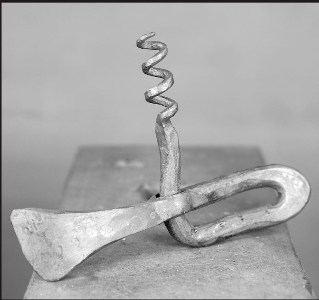
ONE PIECE CORKSCREW FROM ALLOY STEEL