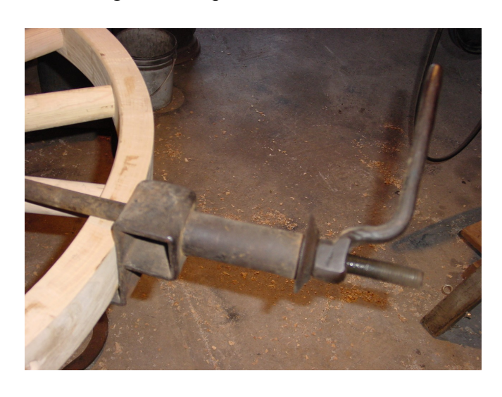
#3 Wheel Sampson. Adjustment end.