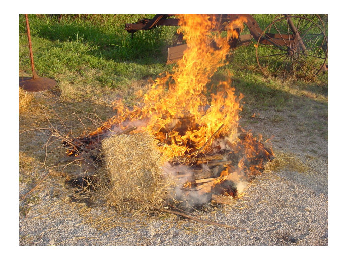
#6 Fire heating wagon tire.