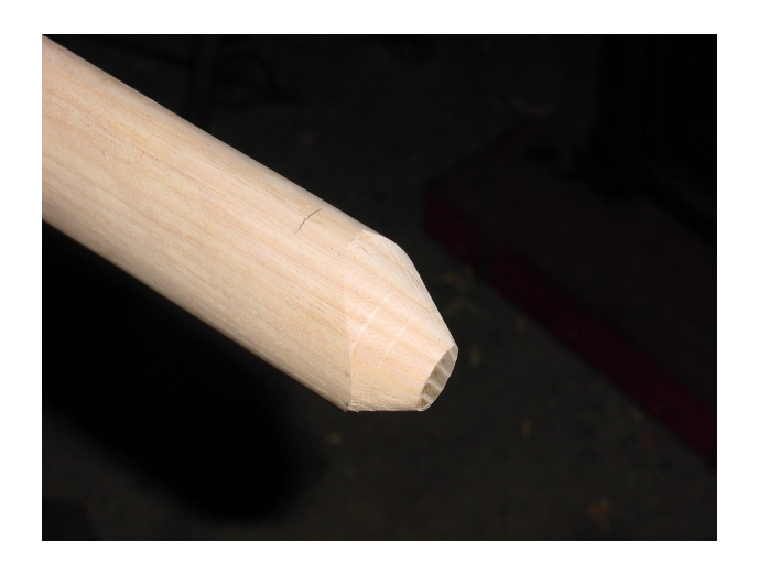
#20 detail of pointed spoke