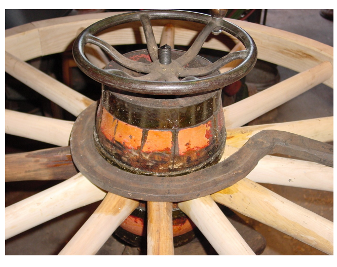
#2 Wheel Sampson on hub.