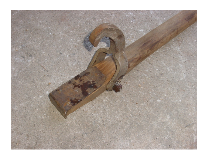
#12 and #13 are close up details of #11