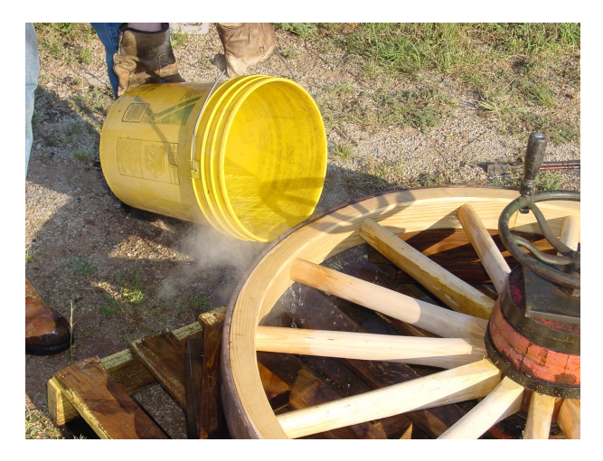
#10 cooling (shrinking) the tire.