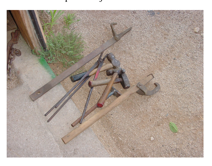
#5 Assorted tools used for setting time- - The two on the outside are for pulling the hot tire onto the wheel