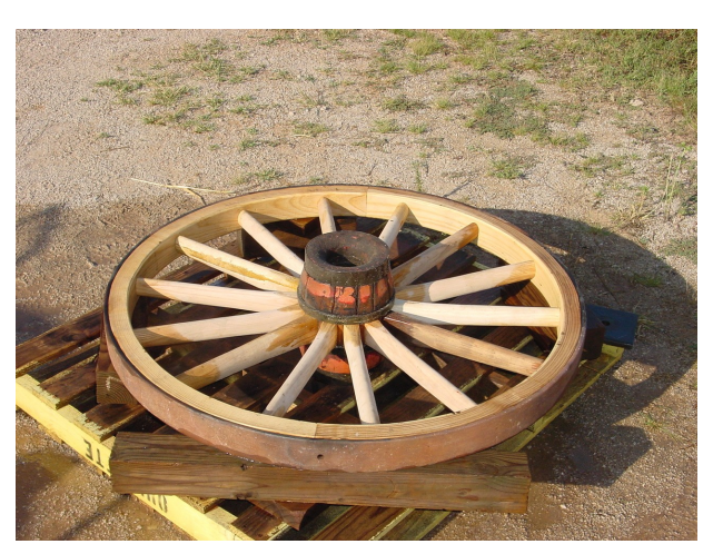
#14 Finished hot set tire.