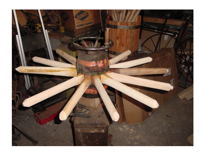
#19 Spider on wheel stand with spokes pointed

The finished wheel turned out good and solid. Ready for many years of use. Tom Nelson