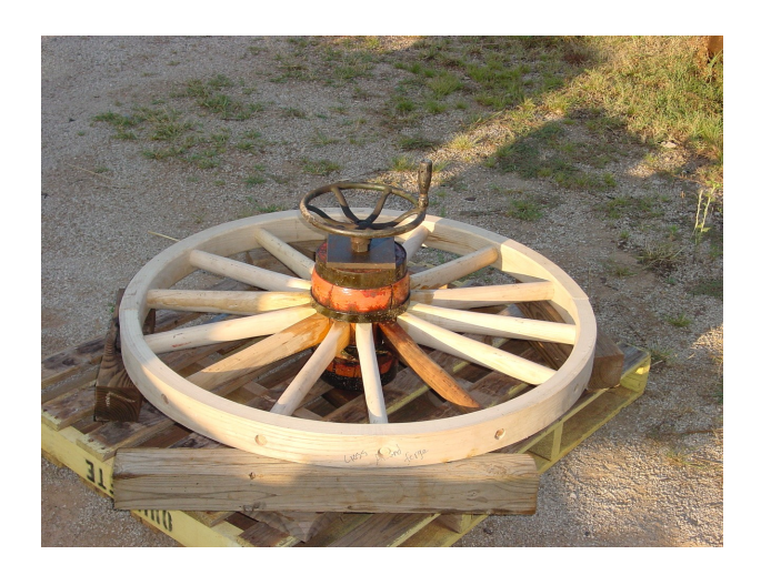
#7 Wheel blocked and secured for setting tire.