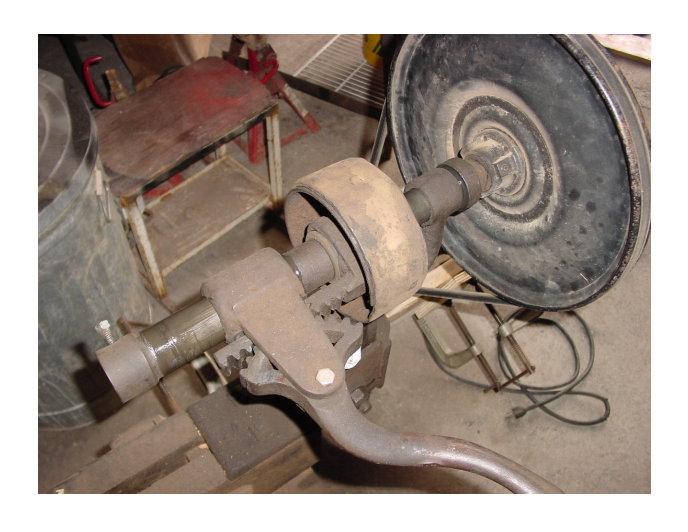
#18 Drive pulley for tenon cutting machine.