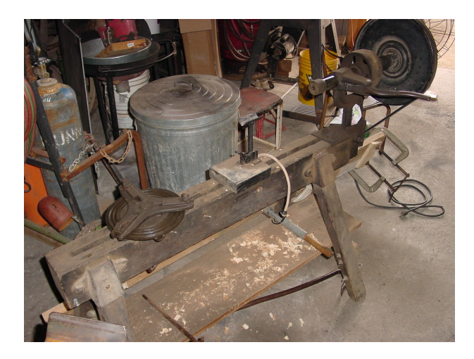
#17 another view of tenon cutter.