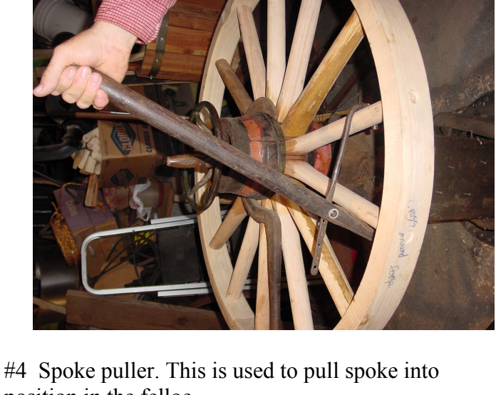
position in the felloe.