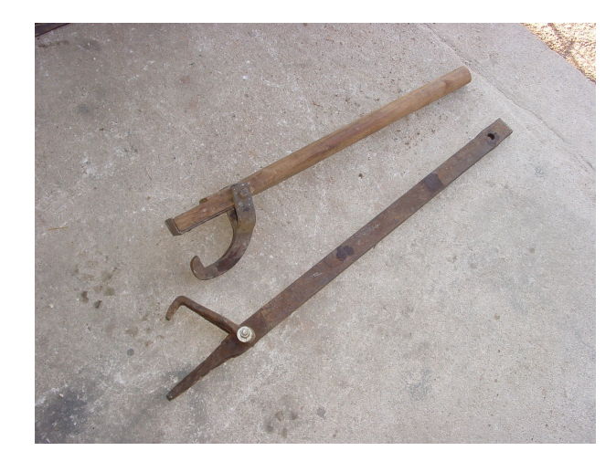
#11 Tire pullers