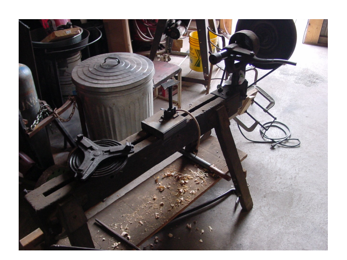
#16 Spoke tenon cutting machine (Dole and Deming).